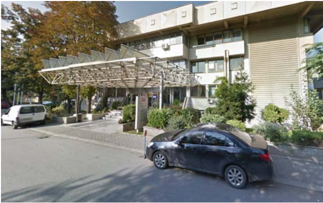
Fig. 1 Photo of IECE

The 3 rd Workshop “Developing and implementing joint research projects and field trip to associated partners” will be held at two venues. The activities of day 1 are planned at Institute for Research in Environment, Civil Engineering and Energy (IECE) premises, while the rest of the activities will be organized at Faculty of Civil Engineering (FCE).