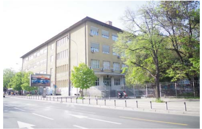
Fig. 2 Photo of FCE