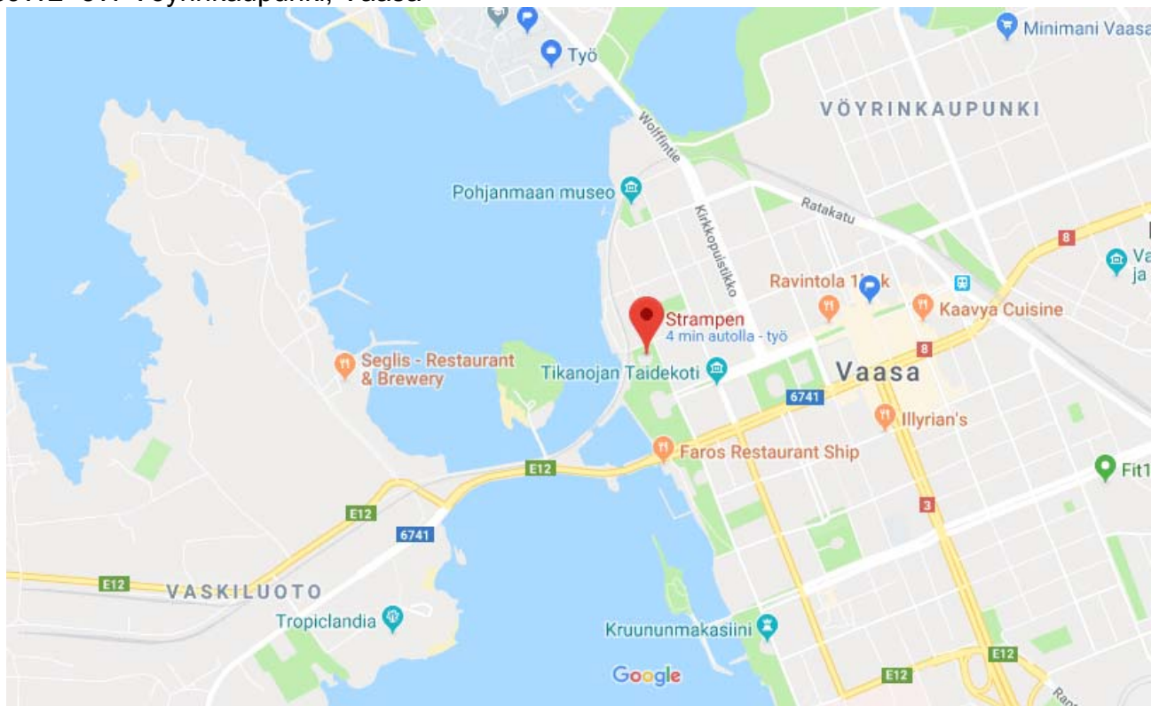
Fig. 3 Map of the Restaurant Strampen.