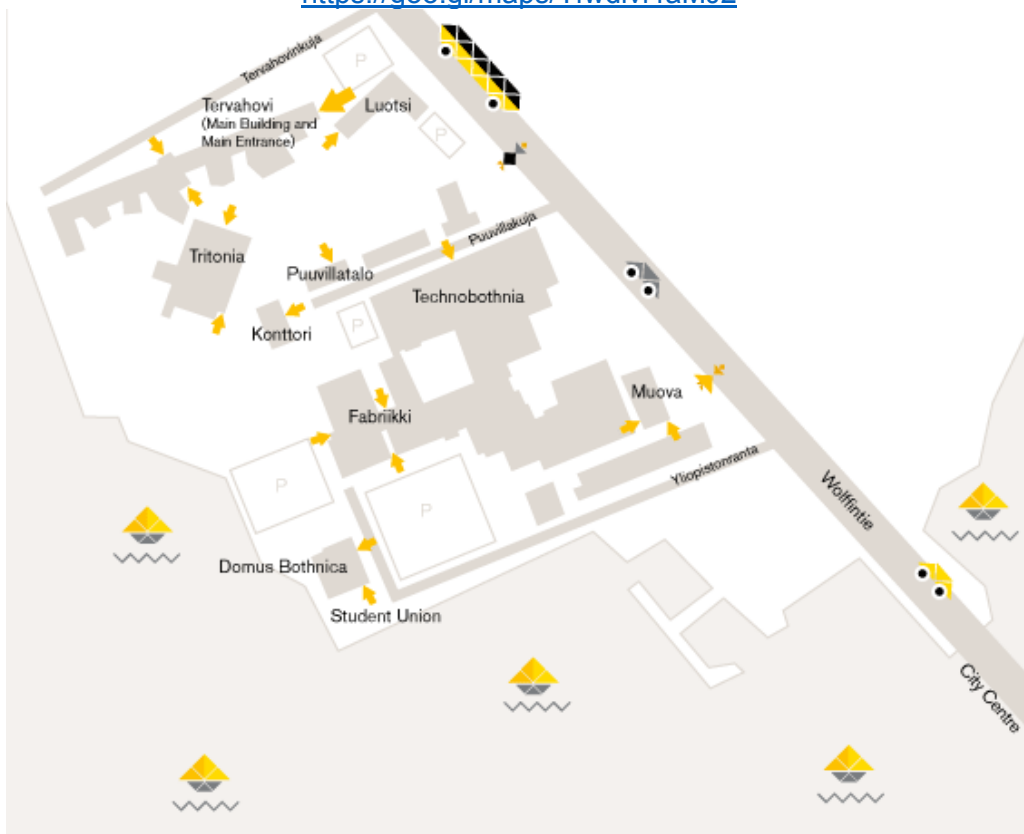
Fig. 2 Map of the University of Vaasa