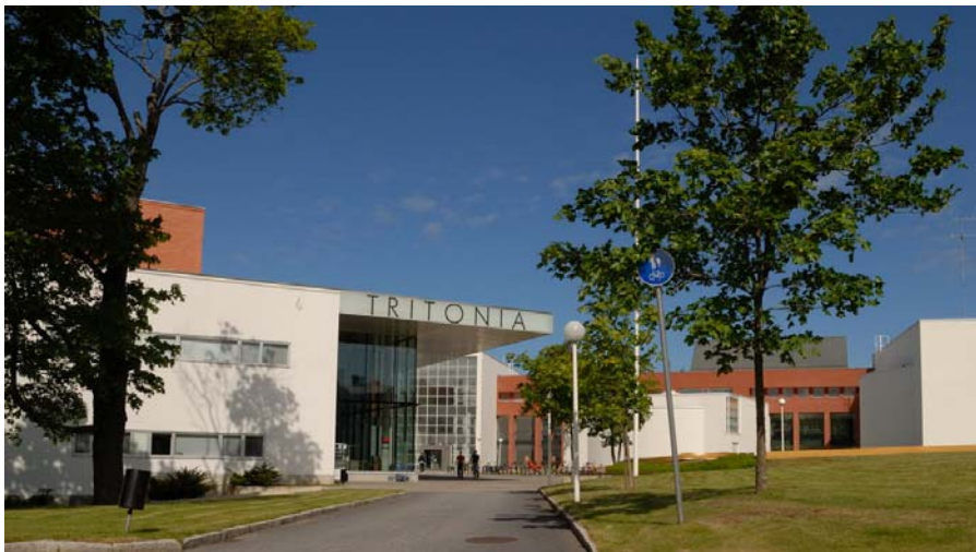
Fig. 1 Photo of the University of Vaasa, Tritonia library. Location: Yliopistonranta 7, 65200 Vaasa, Google: 4H3R+VR Palosaari, Vaasa, https://goo.gl/maps/Tfwdivi4aMJ2

The project meeting will take place at Tritonia Library building, University of Vaasa. Meeting room, 6 th Floor.