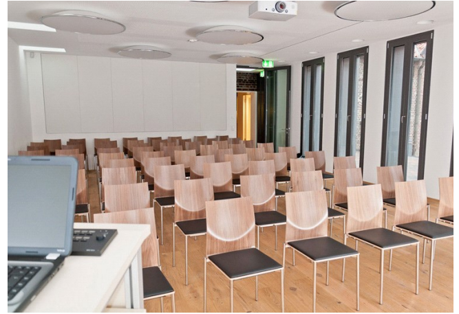
Fig. 1 Photo of the Beckmanns Hof